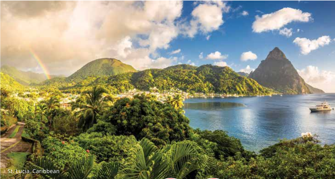
St. Lucia, Caribbean