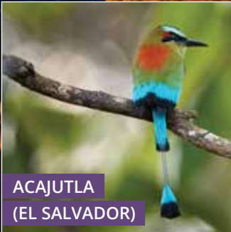
ACAJUTLA (EL SALVADOR)

Known as the ‘Land of Volcanoes’, El Salvador features a landscape embroidered with dramatic volcanic formations, rainforests, and pristine beaches along its Pacific coast. In the capital, San Salvador, visit the impressive National Palace to gain insight into the country’s rich history and cultural heritage.