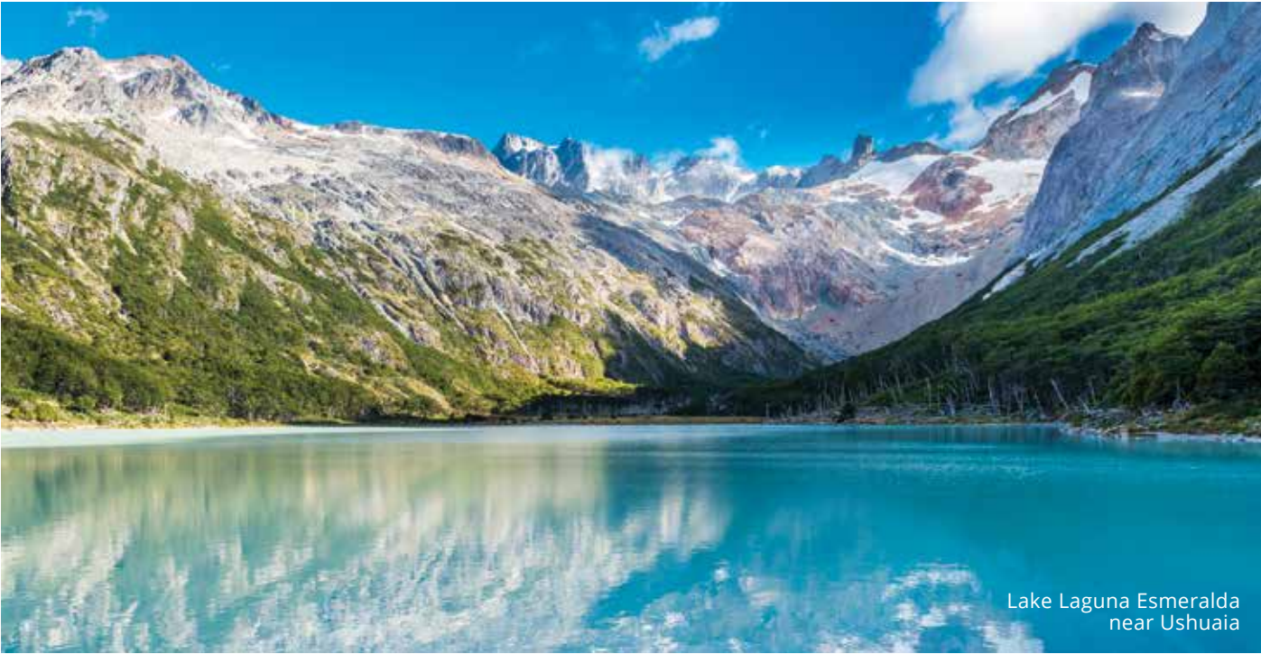
Lake Laguna Esmeralda near Ushuaia

†Fly cruise fares based on London departure - alternative airports may be available at a supplement. | *Based on an obstructed view stateroom.