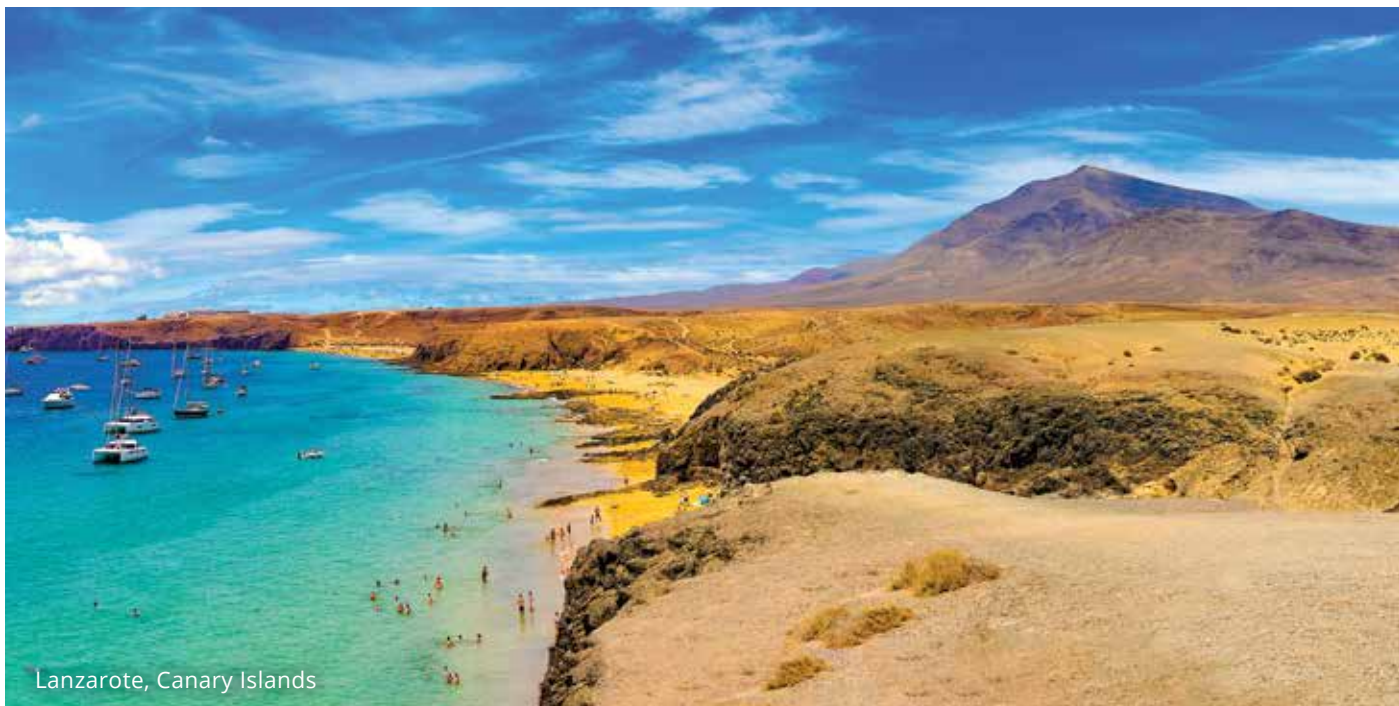
Lanzarote, Canary Islands