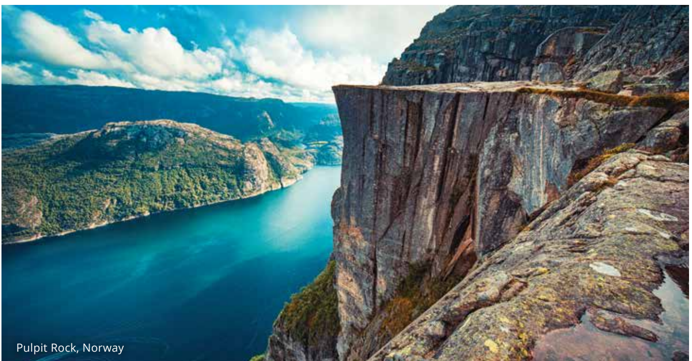
Pulpit Rock, Norway